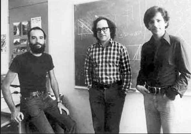
Rivest, Shamir and Adleman inventors of the RSA encryption scheme

Bob verifies n \equiv 1 \pmod{4} , prime.